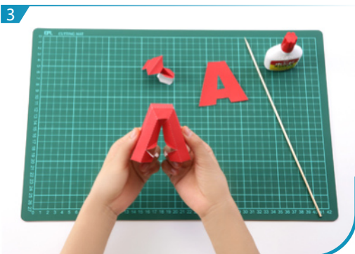
3 Fold and glue A01 and A03 respectively.