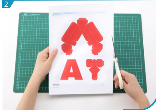
2 Separate all parts along the lines. Mark their identity on the back to avoid confusion.