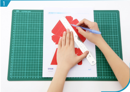
1 Use a pen whose ink has dried out, or a tracer, to trace lines first.